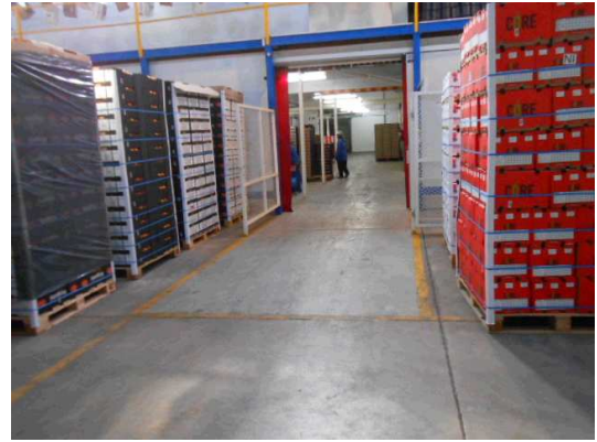
Un obstructed aisles