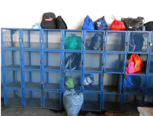
Facilities for keeping employee belongings