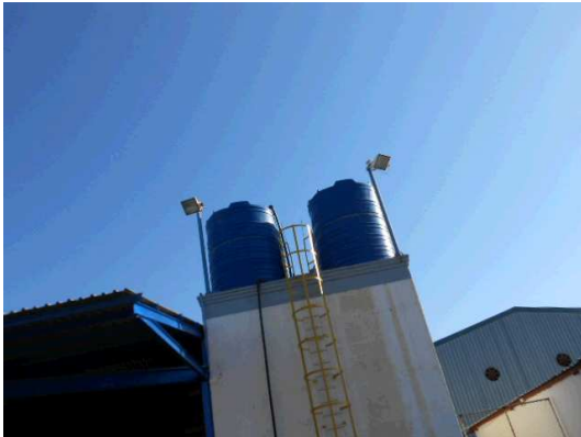
Lighting close to the loading area