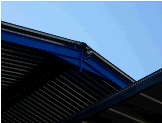
CCTV positioned close to the loading area