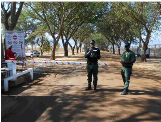
Security guards at the main entrance of the facility