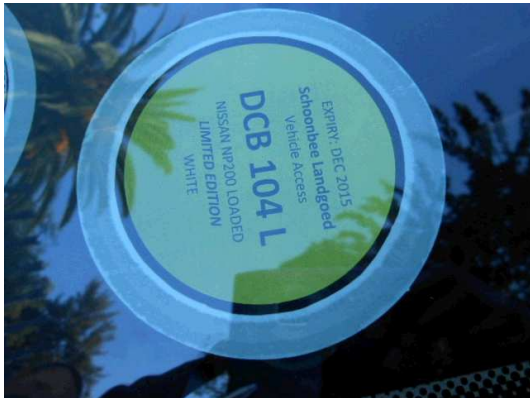
Vehicle access card