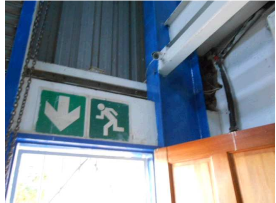
CCTV in the loading area