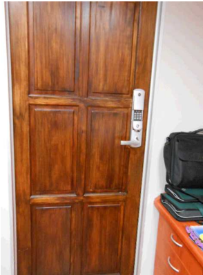
Restricted access into the server room