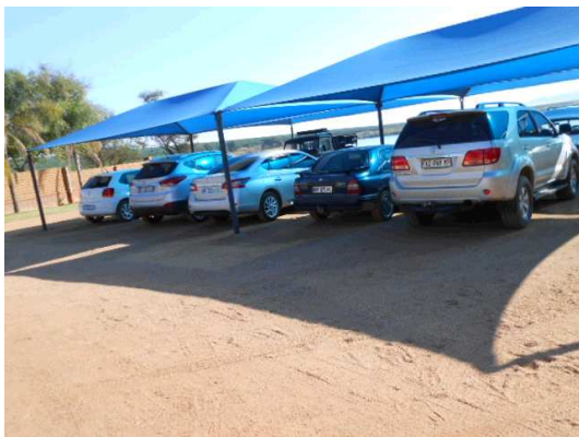
Visitors parking area