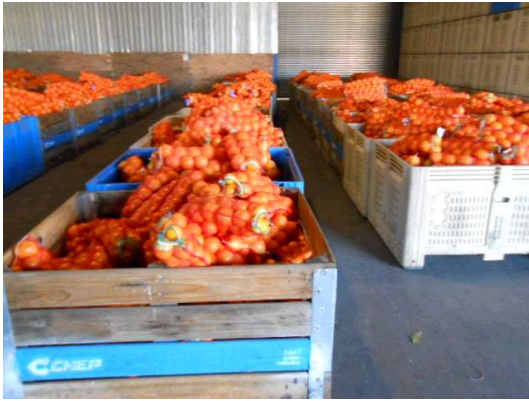
Domestic produce kept is a separate area from produce that is exported