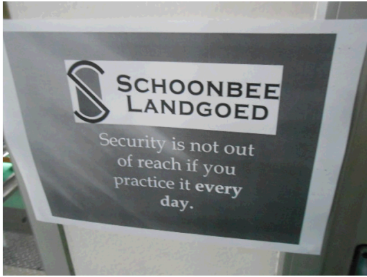
Threat awareness programme posted in prominent positions