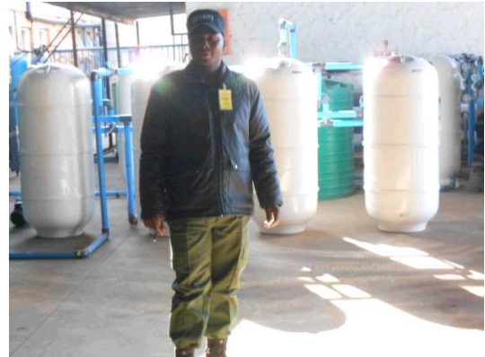
Security guard positioned at the loading area