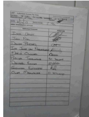
List of employees allowed to enter a restricted area