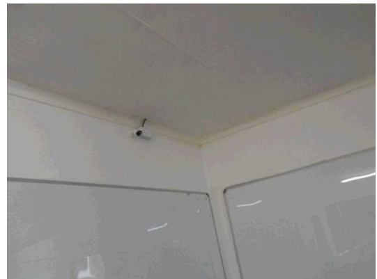
CCTV monitoring activities in the pack house