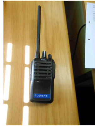
Radios used for communication