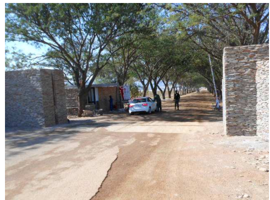
Facility main entrance

The information contained in this document is confidential. If you are not the intended recipient, be aware that any disclosure, copying, distribution, or use of the contents is prohibited. This restriction is applicable to all sheets of this document. If you receive this document in error please notify us so that we can arrange retrieval of the document.