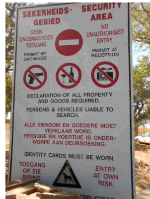
Security signs at the gate

The information contained in this document is confidential. If you are not the intended recipient, be aware that any disclosure, copying, distribution, or use of the contents is prohibited. This restriction is applicable to all sheets of this document. If you receive this document in error please notify us so that we can arrange retrieval of the document.