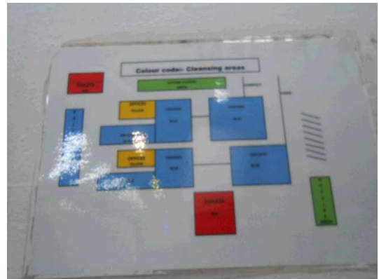
Colour codes for employees

The information contained in this document is confidential. If you are not the intended recipient, be aware that any disclosure, copying, distribution, or use of the contents is prohibited. This restriction is applicable to all sheets of this document. If you receive this document in error please notify us so that we can arrange retrieval of the document.