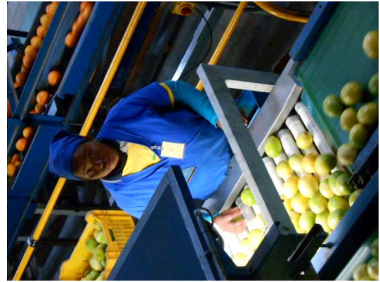
Employee displaying photo badges